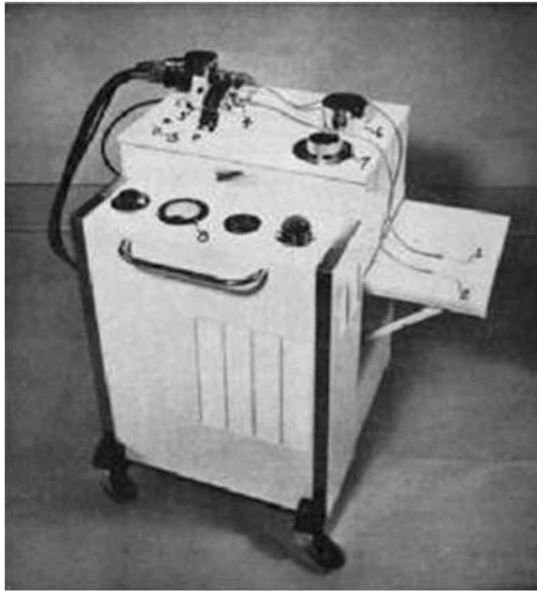
Fig. 25.2. The Knott Hemo-Irradiator